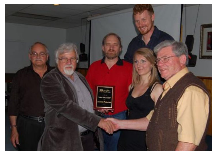
The Liquid Ice Group celebrate their success in taking the First Place Award with their production "Urban Spelunking"

At a reasonable hour, the sleepers were roused (from their sleep), the chairs were put back, the equipment was packed up, the lights were turned off and everyone went home to bed. The crew who normally go to Crabby Joe's for beer and wings and stuff did not make it that far as it appeared that each of them had had their fill at the Kings Buffet earlier in the evening. There was a rumour that three of them got lost on the way home and ended up on the roof of the London Tap House establishment, but that is just a rumour.